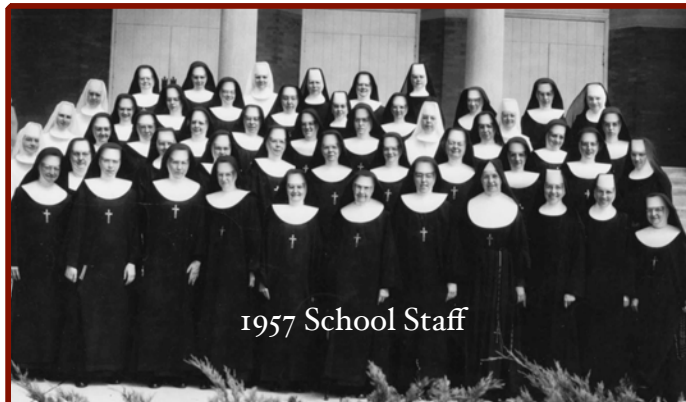
1957 School Staff

Although the mission of the school remains the same, there have also been some very important changes! When the majority of us were attending the school, we were taught by Franciscan Sisters who had committed to our spiritual and academic education! In the late 1960's and early 1970's the ability to supply the good sisters to fill the teaching positions was declining and along came the lay staff that has been in place since the late 1990's.