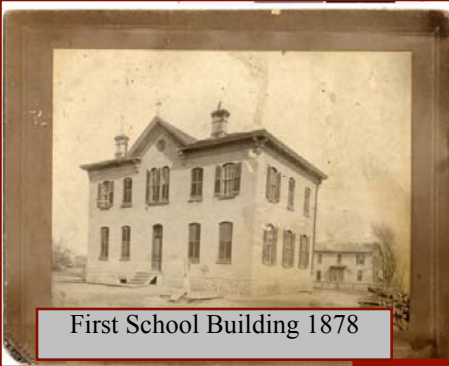
First School Building 1878