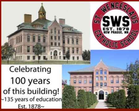
Celebrating 100 years of this building! ~135 years of education Est. 1878~

Saint Wenceslaus School Alumni Association & Friends * 227 Main Street East * New Prague, MN * 56071