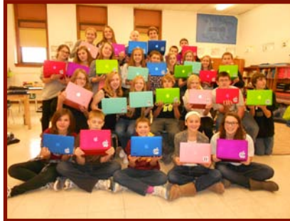
LWL@SWS Learning Without Limits @ St. Wenceslaus